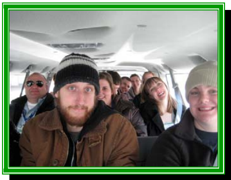
Going on a field trip