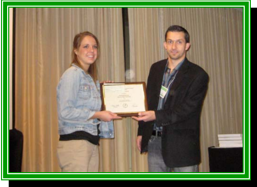
Murray State University