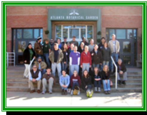
Atlanta Botanical Gardens

was consequently one of the main attractions. On display were several hundred blooming orchids and bromeliads as well as many aroids, ferns, palms and many other tropical flora.