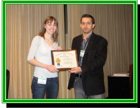
1 st Place – Texas A&M University