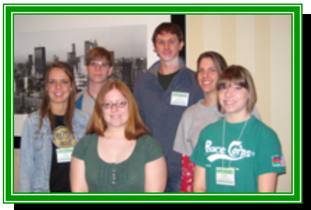
Newly elected ACB Officers for 2009-2010