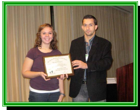
3 rd Place – Mississippi State University