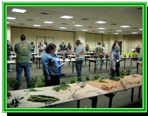
J. Benton Storey Judging Contest