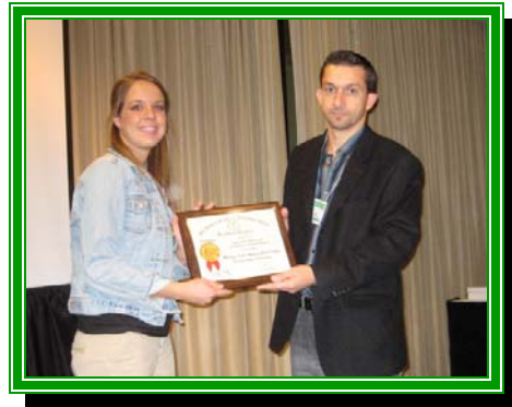
2 nd Place – Murray State University