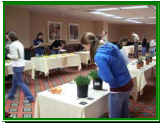
Scene from the J. Benton Storey Horticulture Judging Contest

In the afternoon the clubs participated in an outstanding J. Benton Storey Horticulture Judging Contest.