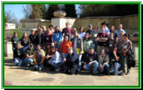
ACB students tour the Dallas Botanical Gardens.

Saturday afternoon the clubs visited the Dallas Botanical Gardens and were taken on a behind the scenes tour.