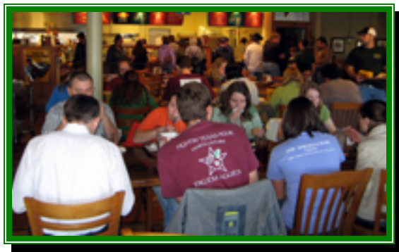
ACB students enjoy a meal on the tour.